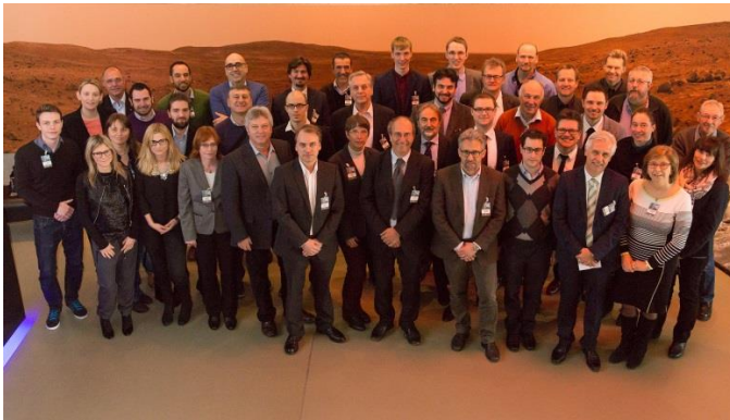
EDEN ISS team photo, Credit: DLR 2015

The consortium is led by the German Aerospace Center (DLR) Institute of Space Systems in Bremen, Germany and includes the following partners;